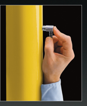
UTG M Thru-Paint models measure the metal thickness of a painted structure without having to remove the coating.

Measures the wall thickness of materials such as steel, plastic and more